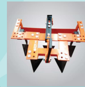
5 Tynes Cultivator