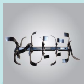
Dry Land L-Type Blades