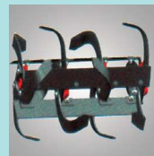
Wet Land Blades